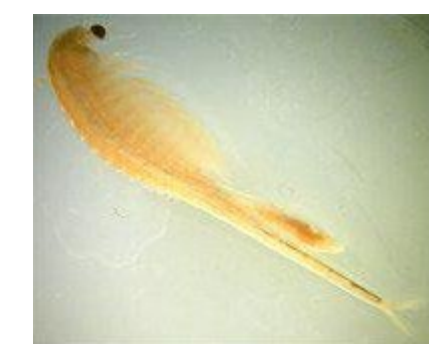
Conservancy FS FWS