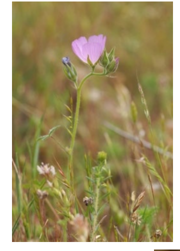
Keck's Calscape