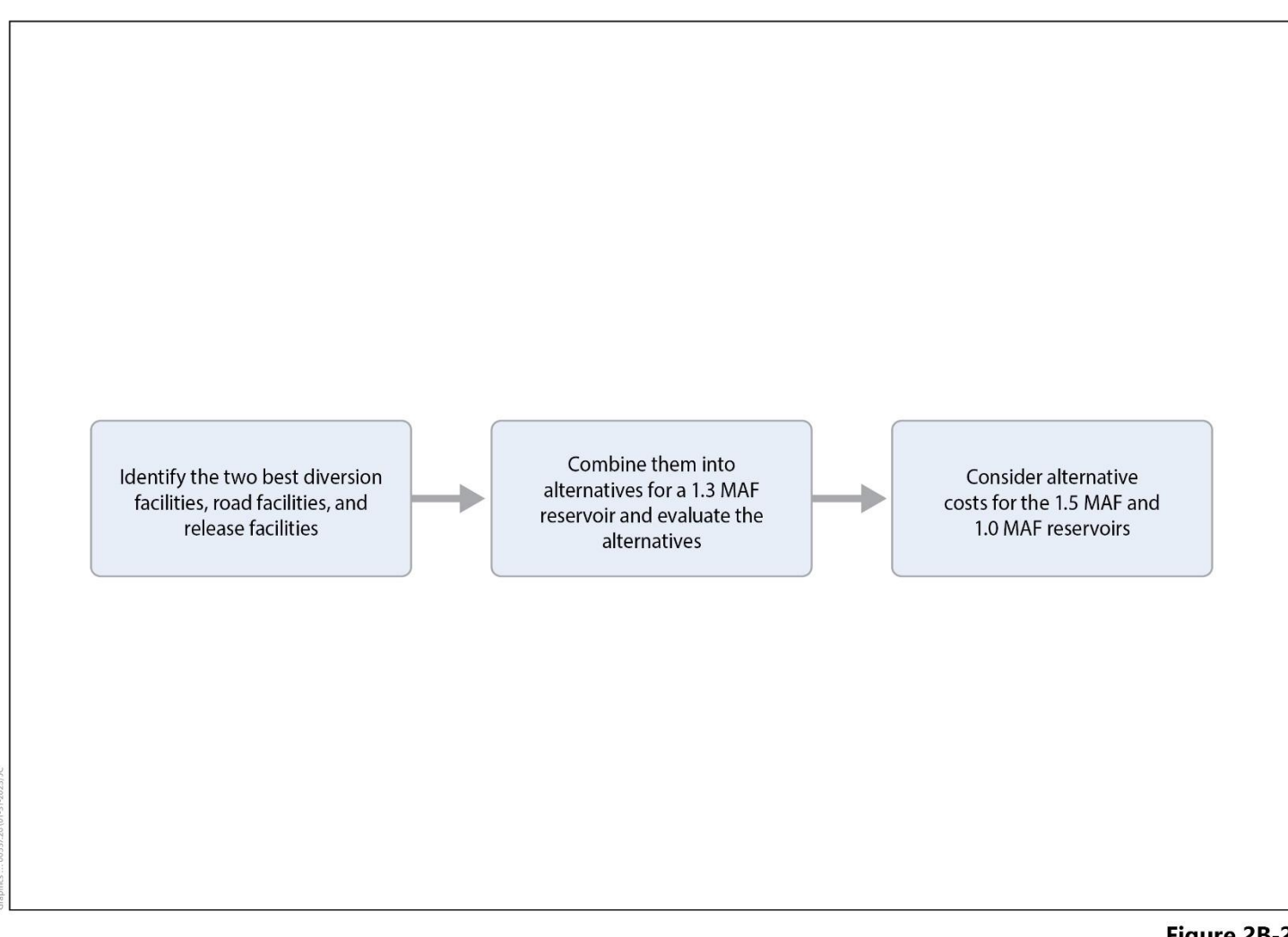
Figure 2B-2 Value Planning Approach