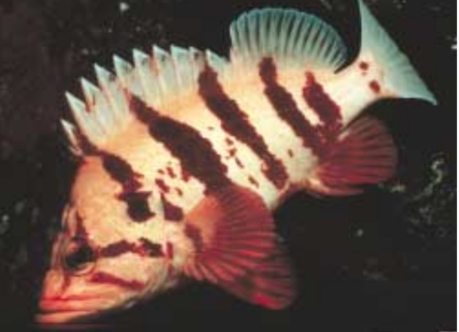
The tiger rockfish ( Sebastes nigrocinctus ) is in long-term decline in Puget Sound.

analysis suggests severely endangered) (CA Department