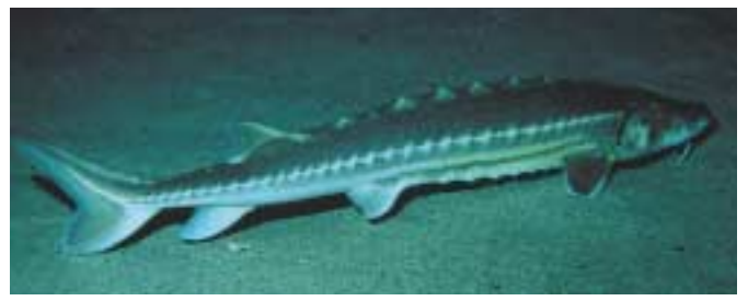
The rare green sturgeon ( Acipenser medirostris ) is endangered in California and Oregon.