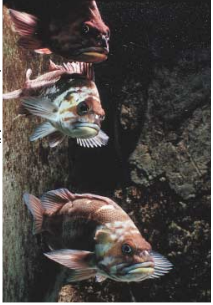
Very low productivity is one factor in classifying the copper rockfish ( Sebastes caurinus ) as vulnerable in Puget Sound.