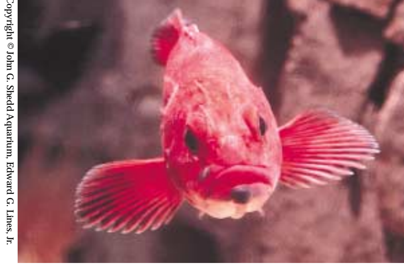
The yelloweye rockfish (Sebastes ruberrimus) has very low productivity and has virtually disappeared from recreational catches in Puget Sound.