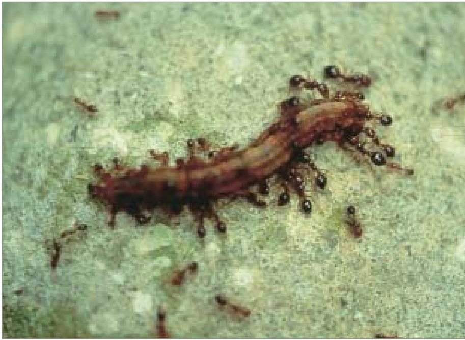
Red imported fire ants will attack both adult and larval insects such as the armyworm, left , on the ground or on plants. As such, they can have the positive effect of controlling agricultural pests such as the cotton bollworm. However, they also attack beneficial insects.

open nursery acreage that produces container plants would be affected by quarantine regulations. Based on the 1997 Census of Agriculture, 28,000 acres in California were devoted to open field nursery production of bedding and flower plants, foliage, potted flowers and other nursery stock (USDA 1999). Because all nurseries within quarantined regions — whether infested or not — must treat in order to ship outside of the quarantine, almost all nurseries would be affected by the regulations. Therefore, we estimated total costs to the nursery industry on all open field acreage to be $18.2 million. In addition, nurseries would be required to be inspected for the ants by placing bait out quarterly. Additional costs for inspection and certification are about $1.40 per acre.