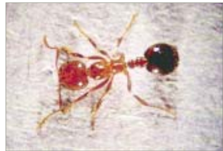
Texas A&M University

Although the U.S. Department of Agriculture and California Department of Food and Agriculture (CDFA) have maintained quarantines regulating the movement of soil, hay and equipment from regions inhabited by red imported fire ants, over the last 15 years they have been intercepted on numerous occasions at California border stations, and periodic outbreaks have occurred in several counties. The ants arrived on trucks, trains or other vehicles. In 1997, they were identified on bee shipments from Texas destined for almond orchards in the San