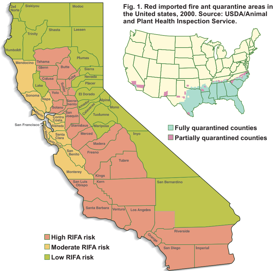
Fig. 1. Red imported fire ant quarantine areas in the United States, 2000.