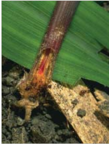
Red imported fire ants are notoriously difficult to eradicate. In Texas, county extension agent Glenn Avriett, left , treats a mound with the insecticide acephate. Ants can damage crops like corn, right , but most pesticide treatments would be undertaken to protect farmworkers, agricultural and electrical equipment, and irrigation systems.

less the probability of success for the first 5-year period program times the costs for the second. The expected benefits are equal to the probability of success for the first period times the total benefits plus the probability of failure for the first period times the probability of success for the second times the benefits. The probability of success during the second 5-year funding period is unknown. Consequently, the cost/benefit analysis estimates the probability of success that is needed for the expected benefits to be equal to the expected costs (table 4).