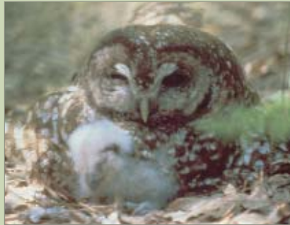
UC Natural Reserve System

Red imported fire ants disrupt ecosystems and endanger wildlife by preying on other insects; eating mammal, reptilian and bird newborns, and soft-shelled eggs; destroying habitat; and reducing food sources. The following endangered species could be at even greater risk if the ants become widely established in California.