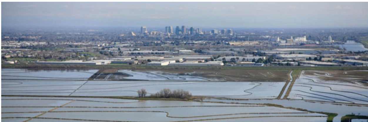
Yolo Bypass

Accomplishing the array of discrete actions articulated in the Action Plan requires a significant new investment of public resources, as well as state agency alignment and oversight, and a concerted focus on outcomes. In addition, continued support by the Legislature and the public is required for the many water-related efforts not explicitly referenced in the Action Plan (e.g. the measurement, analysis, integration, and sharing of essential water management data). Additional resources are needed (to replace funding provided in the past by general obligation bonds) for DWR to prepare the five-year updates to the California Water Plan as required by the California Water Code and depended on by water managers across the state. While not described explicitly in the Action Plan, these types of state services are foundational to its success.