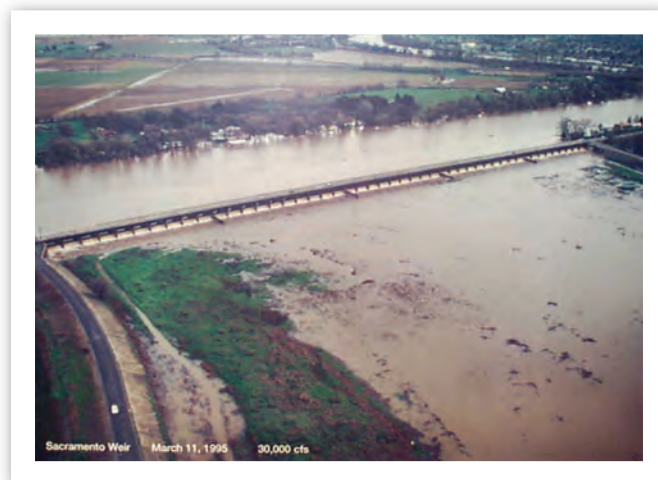
The Sacramento Weir provided flood protection for the City of Sacramento in 1995

This State Plan of Flood Control (SPFC) Descriptive Document is the first inventory of the SPFC that has been compiled or referenced in a single report. Until now, much of the information on the SPFC has been individually maintained for each of the many flood protection projects that constitute State-federal flood protection along the Sacramento and San Joaquin