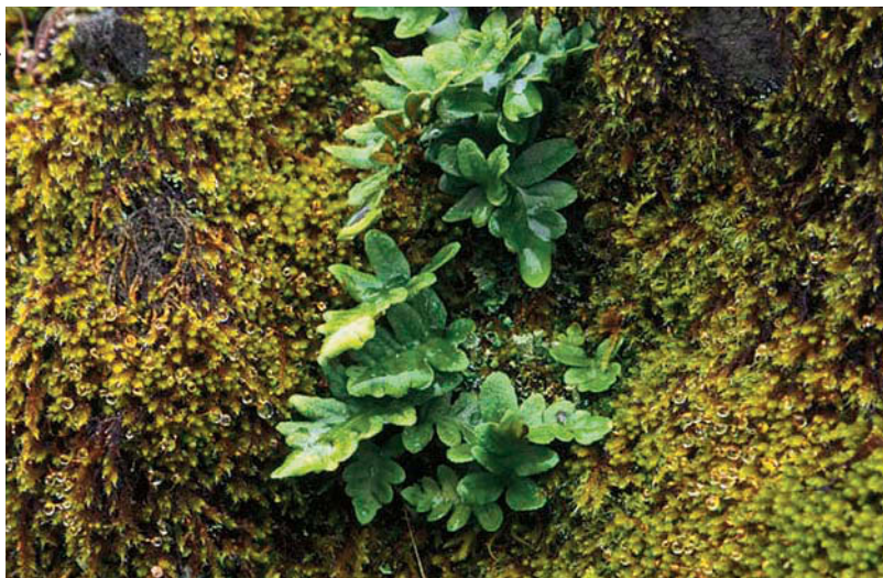
Moss and ferns cover an oak at the UC Hopland Research and Extension Center.

180-page Guidelines for Managing California's Hardwood Rangelands , which covers how to keep oak woodlands both protected and profitable.