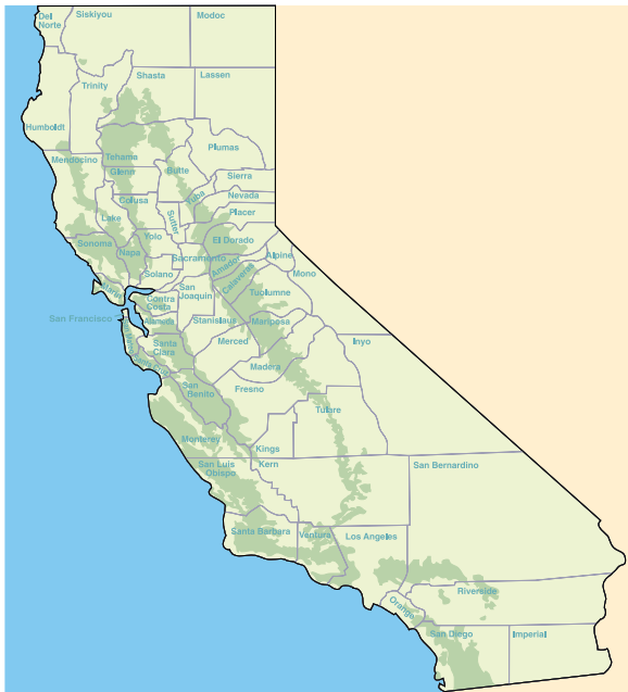
Distribution of oak woodlands and forests in California (shaded area).