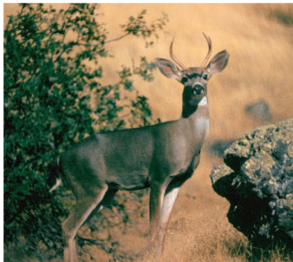
ANR Communication Services

Oak woodlands provide critical habitat for California native species, including 2,000 plants, 5,000 insects, 160 birds and 80 mammals. Above, a mule deer feeds on seedlings and other plants.