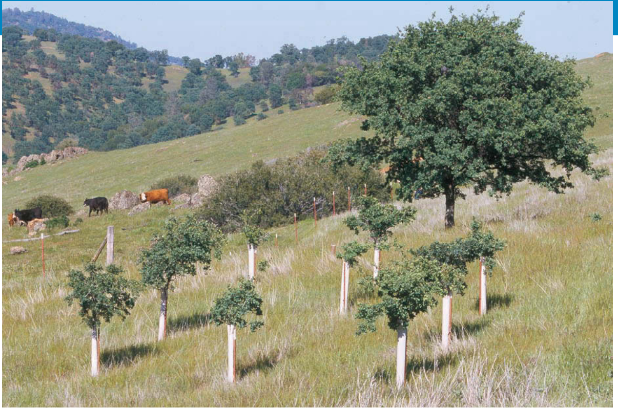
Simple protections, such as fencing and plastic treeshelters (shown at the UC Sierra Foothill Research and Extension Center), can improve the survival of oak seedlings in areas heavily grazed by cattle and deer.

— continued from page 8 featured sessions on issues from tree health to oak woodland stewardship and planning.