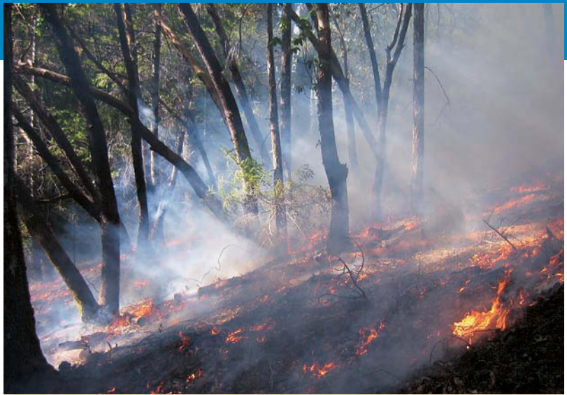
A controlled fire in Humboldt County helps remove contaminated leaf litter.