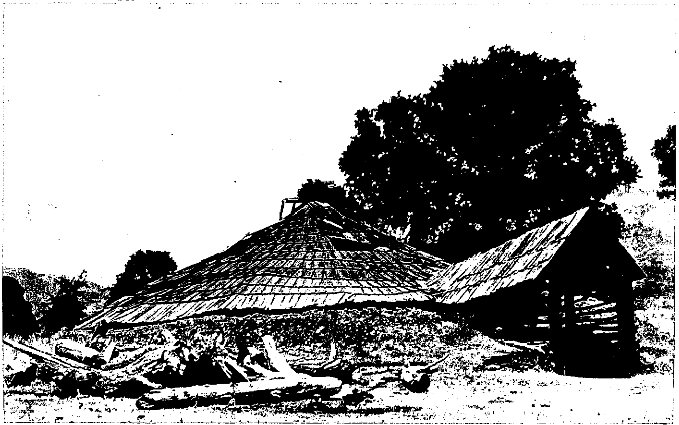
Fig. 3. A semisubterranean dance house at Paskenta. Photograph by Walter Goldschmidt, 1938.

of fines for specific criminal acts, but by negotiation between the two disputant parties. Wealth therefore played an important part, not only in the establishment of status, but also in the maintenance of law and order.