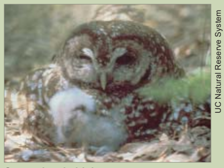
Spotted owl chick

Red imported fire ants disrupt ecosystems and endanger wildlife by preying on other insects; eating mammal, repitilian and bird newborns, and softshelled eggs: destroving habitat: and reducing food sources. The following endangered species could be at even greater risk if the ants become widely established in California.