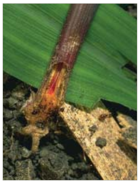
Red imported fire ants are notoriously difficult to eradicate. In Texas, county extension agent Glenn Avriett, left, treats a mound with the insecticide acephate. Ants can damage crops like corn, right, but most pesticide treatments would be undertaken to protect farmworkers, agricultural and electrical equipment, and irrigation systems.

less the probability of success for the first 5-year period program times the costs for the second. The expected benefits are equal to the probability of success for the first period times the total benefits plus the probability of failure for the first period times the probability of success for the second times the benefits. The probability of success during the second 5-year funding period is unknown. Consequently, the cost/benefit analysis estimates the probability of success that is needed for the expected benefits to be equal to the expected costs (table 4).