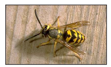
Figure 1. Western yellowjacket.

Nests of both yellowjacket (Fig. 2) and paper wasps typically are begun in spring by a single queen, who overwinters and becomes active when the weather warms. She emerges in late winter to early spring to feed and start a new nest. From spring to midsummer nests are in the growth phase, and the larvae require