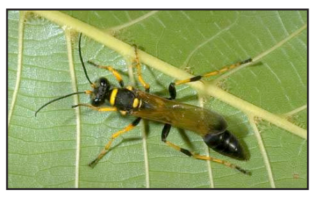
Figure 5. Mud dauber.

concern is a condition that results from multiple-sting encounters, sometimes unfamiliar to attending health professionals, that is induced by the volume of foreign protein injected and the tissue damage caused by destructive enzymes in wasp venom. Red blood cells and other tissues in the body become damaged, and tissue debris and other breakdown products are carried to the kidneys, to be eliminated from the body. Too much debris and waste products can cause blockages in the kidneys, resulting in renal insufficiency or renal failure. Patients in this condition require medical intervention, which can include dialysis.