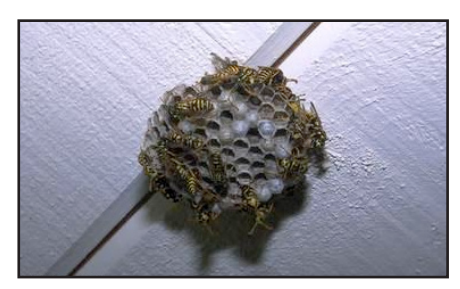
Figure 4. Paper wasp nest.