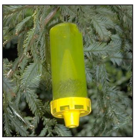
Figure 6. Yellowjacket lure trap.

Water traps. Water traps generally are homemade and consist of a 5-gallon bucket, string, and protein bait such as turkey, ham, fish, or liver. Fill the bucket with soapy water, and suspend the protein bait 1 to 2 inches above the water. A wide mesh screen over the bucket will help prevent other animals from reaching and consuming the bait. After the yellowjacket removes the protein, it flies down and becomes trapped in the water and drowns. Like the lure trap, these traps also work best