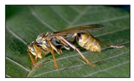
Figure 3. Paper wasp.

Reactions to wasp stings vary from only short-term, intense sensations to substantial swelling and tenderness, some itching, or life-threatening allergic responses. These reactions are discussed in detail in Pest Notes: Bee and Wasp Stings . (See References.) Of specific