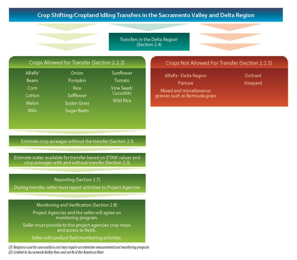
Figure 2-1 Cropland idling/crop shifting transfers process flow chart

The information requested for a cropland idling/crop shifting water transfer proposal is detailed in the Crop Idling Checklist (Appendix B). This information will help Project Agencies review the water transfer proposal and develop the appropriate conveyance contract or letter of agreement between the transfer proponents, buyers, and Project Agencies. Sellers are encouraged to work with their water purveyor (e.g., water district) to develop joint water transfer proposals.