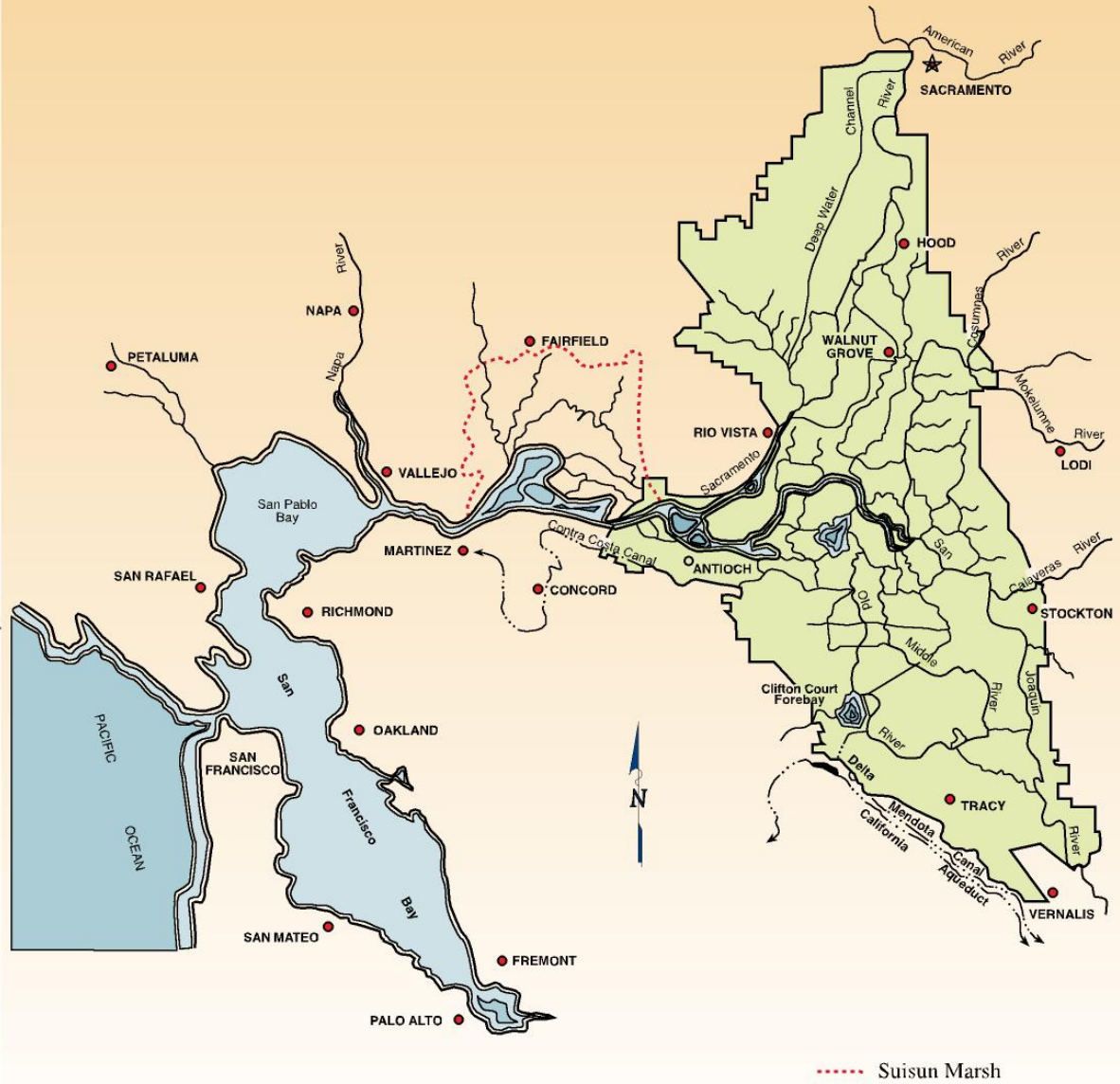
FIGURE 1 BAY-DELTA ESTUARY

analysis for those changes. Documents used to develop this amendment of the 1995 Plan are listed in Appendix 2, titled "Referenced Documents". Appendix 3,