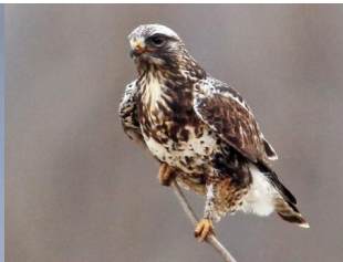
Rough-legged Hawk Adult male light morph