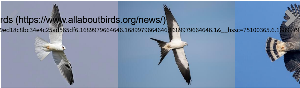
White-tailed Kite (/guide/White-tailed_Kite/overview)