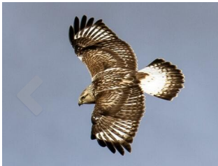
Rough-legged Hawk Juvenile light morph