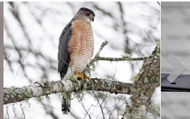
Cooper's Hawk Adult

(/guide/Northern_Harrier/species{/guide/Northern_Harrier/species{/guide/Northern_Harrier/species{/guide/compare/71545691}) (/guide/Northern_Harrier/species{/guide/Northern_Harrier/species{/guide/compare/71545631}) (/guide/Northern_Harrier/species{/guide/compare/60324921})