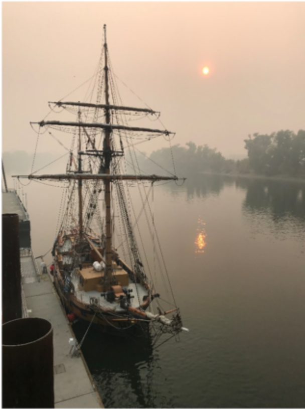
Poor air quality envelops the Sacramento region as shown in this picture of the Tower Bridge dock on the Sacramento River. Photo taken at 3:30PM on November 15, 2018.

The Mendocino Complex Fire in July 2018 consumed more than 450,000 acres, dwarfing the previous record-setting Thomas Fire's 280,000 acres just six months earlier. The Mendocino Complex Fire covered some 700 square miles and burned 280 structures in Colusa, Glenn, Lake, and Mendocino counties. Also in July, the Carr Fire in Shasta and Trinity counties covered almost 230,000 acres, largely destroying the town of Keswick and more than 1,600 structures. California's most destructive fire came in November as the Camp Fire in Butte County extended across more than 150,000 acres. The Camp Fire would end up destroying the town of Paradise, resulting in 85 deaths and the loss of more than 18,000 structures.