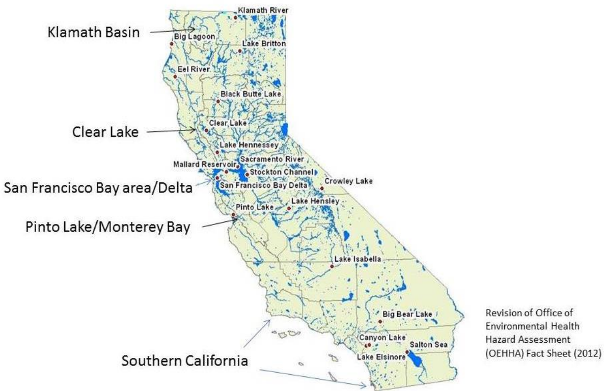
Figure 3. Areas in California with recurrent blooms and ongoing monitoring activities

In 2014, there were so many cyanoHAB blooms in coastal habitats reported to the San Diego Regional Water Board that an ad hoc field survey was conducted of estuaries, lagoons, lakes, and reservoirs. Microcystins were detected at several lakes at varying concentrations and microscopic examination of water samples indicated multiple, potentially toxic species at the sites sampled. Four lakes in Riverside, CA were sampled in the spring of 2014 and multiple toxins were detected simultaneously, including cylindrospermopsin, anatoxin-a and microcystins, with several samples containing cyanotoxin concentrations above recreational action level thresholds (see Appendix C for OEHHA action level thresholds). Additionally, four lakes in the Los Angeles and Orange County areas have experienced costly fish kills, attributed to blooms of the toxin producing golden algae, Prymnesium parvum .