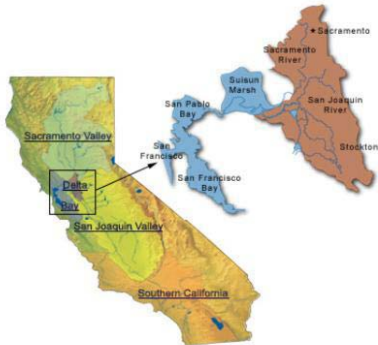
Figure 1. Map of the San Francisco Bay-Delta, which includes the San Francisco Bay and the delta of the Sacramento and San Joaquin rivers (source: California Bay Delta Authority, Bay-Delta Program).

summers and milder winters. The San Joaquin River receives water from tributaries draining the Sierra Nevada and Coast Ranges, and except for streams discharging directly to the Sacramento-San Joaquin Delta, is the only surface-water outlet from this basin.