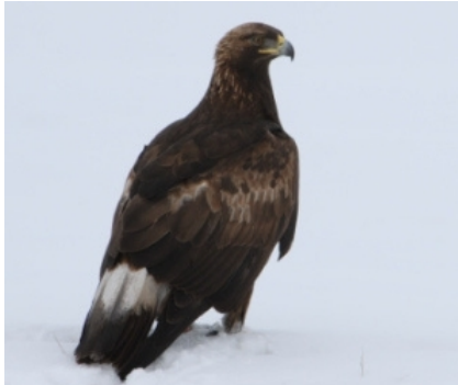
Golden Eagle.

Nongame Wildlife Program, Wildlife Branch.