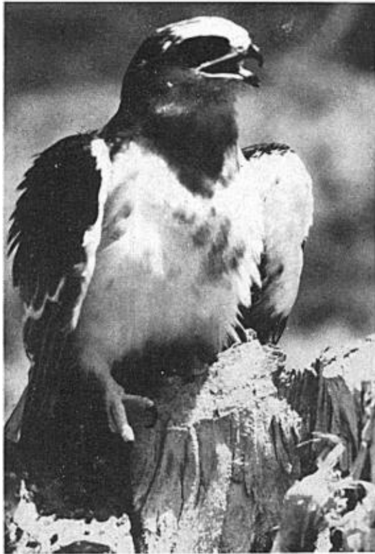
Fig. 5. Young White-tailed Kite just out of nest.

needle grass ( Bromus rigidus ). Here the grass had accumulated over the seasons until a mulch several inches deep had covered the area. In this place we also noted a female coyote ( Canis latrans ) lying flat on her stomach with one paw raised. Soon there was a wriggling in the dry grass in front of her and she brought her paw down quickly but firmly and reached under it with her nose and withdrew a meadow mouse. This locality contained the greatest concentration of meadow mice we observed. The surrounding area was somewhat overgrazed and this no doubt had forced the mice into this area.