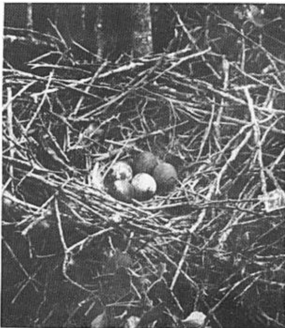
Fig. 3. Nest and eggs of White-tailed Kite.

Moore and Barr (1941) have described the plumage of the young kite. We have observed that when the young birds leave the nest (fig. 4) they are quite different in