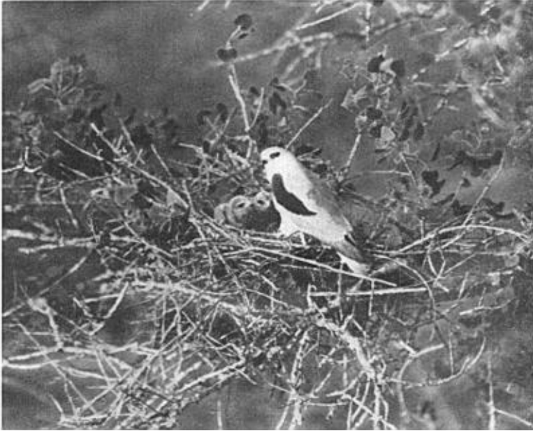
Fig. 4. White-tailed Kite at nest with small young in cottonwood tree.

Of the broods banded, 15 were located in cottonwood trees, five in live oak, two in orange trees, and one in a black willow. To date we have received only three returns of bands. They are as follows: one young kite, banded on May 16, 1943, was found dead on January 26, 1944, about 12 miles east of the point of banding; one banded on May 4, 1944, was found dead under the nest tree on May 30, 1944; and one banded on April 28, 1946, was killed on November 11, 1948, about 100 miles north of the point of banding.