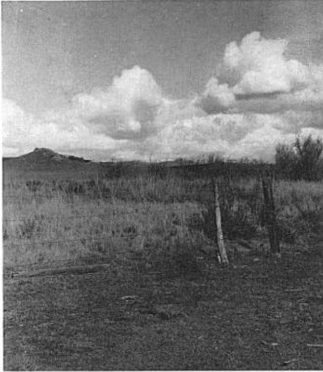
Fig. 2. Typical kite feeding area. Note overgrazing in foreground and dense grass beyond fence. Dead willows behind were used as perches.

variably repulsed by the female (Hawbecker, 1942). The male then, in many instances, endeavors to select a nesting location and even makes a haphazard effort at nest building. The site he chooses is apparently not acceptable to the female, for we have never seen a female use such a nest site when she started building.