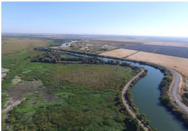
Figure 5: Prospect Island and adjacent farmlands along Miner Slough

163 Flood protection for the agricultural 164 operations in the region is provided by 165 levees and the Reclamation Districts 166 that maintain them. 1 It is possible to 167 link long-term levee maintenance and 168 agricultural operations with 169 conservation outcomes. For example, 170 maintaining hedgerows at the margins