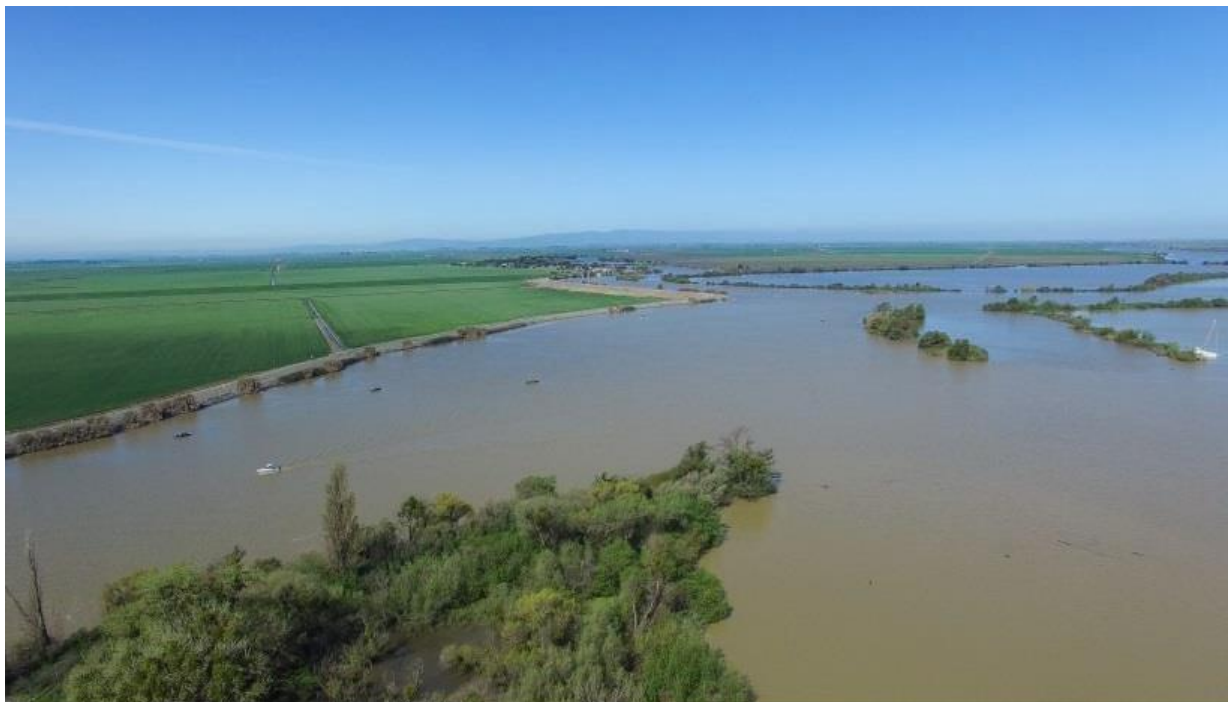
Figure 3: Liberty Island looking northwest towards Lindsey Slough.

64 The Cache Slough Restoration Planning partnership (CSRPP), led by the Sacramento-San Joaquin Delta 65 Conservancy, is currently developing a broad restoration strategy, or Regional Conservation Strategy , for the CSC. 3 66 Building on the California EcoRestore and FRP efforts described above, the CSRPP is developing a locally 67 supportable vision and strategic planning approach that reduces potential conflicts between land uses 68 (agriculture, flood protection, and conservation) and that recognizes opportunities for a landscape-level integrated