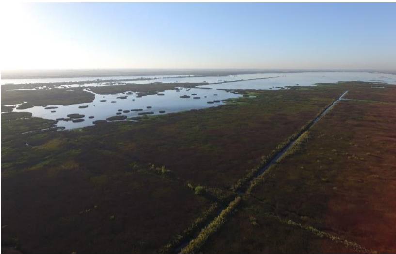
Figure 2: Northern Liberty Island tidal wetlands

61 approach including restoration strategies, using regional conceptual models; key drivers for tidal restoration 62 outcomes; a procedure for assessing the restoration potential of available properties; principles for approaching 63 landscape-scale restoration; and compatibility with other regional plans.