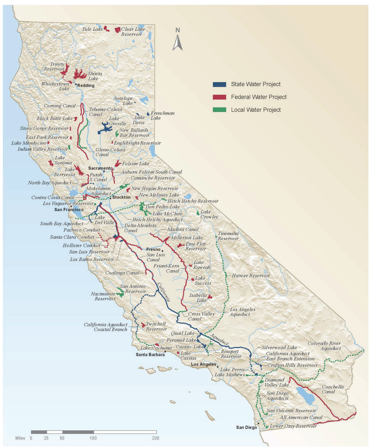
Figure 1 Location of Local, State, and Federal Water Projects