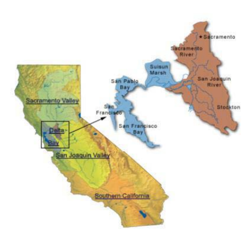
Figure 1. Map of the San Francisco Bay-Delta, which includes the San Francisco Bay and the delta of the Sacramento and San Joaquin rivers (source: California Bay Delta Authority, Bay-Delta Program).

summers and milder winters. The San Joaquin River receives water from tributaries draining the Sierra Nevada and Coast Ranges, and except for streams discharging directly to the Sacramento-San Joaquin Delta, is the only surface-water outlet from this basin.