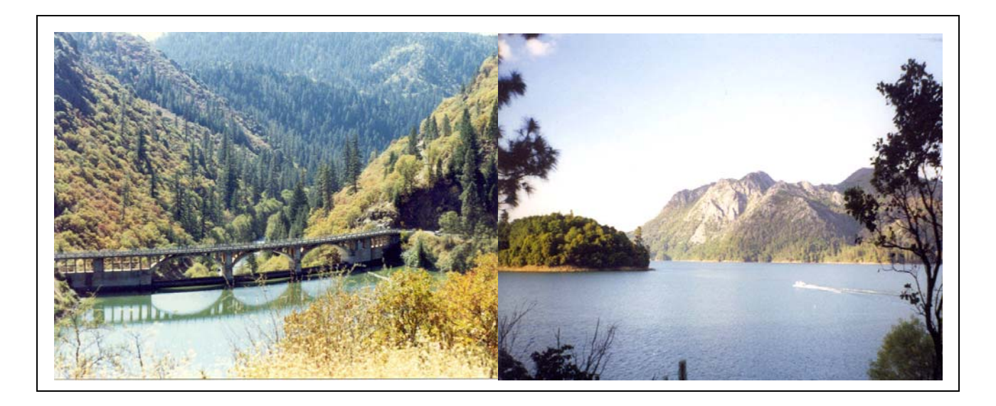
Figure 3. Contrasting bald eagle habitats found in the Pit River canyon located below Lake Britton, Shasta Co. (left) and in open water of Shasta Lake, Shasta Co. (right).

<u>Radio tracking (telemetry)</u>. Many bald eagle pairs are relatively easy to follow visually if nesting in open water territories, and radio tracking is often not required to delineate use areas. However, if eagles are nesting near riverine, timbered canyons (Figure 3), visual contact may not be possible without the aid of telemetry. For typical small-scale project assessments, telemetry may be too time-consuming and not cost-effective; however, for long-term and large-scale management studies in difficult terrain (see Hunt, et al. 2002), the use of radio tracking may be most appropriate.