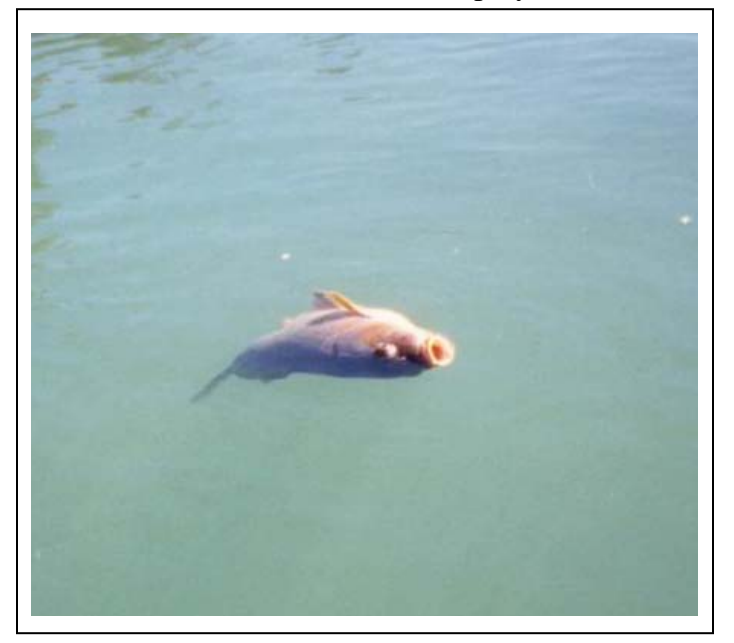
Figure 5. Moribund carp on the surface of Shasta Lake, Shasta Co.

To avoid biases associated with using just one technique to assess bald eagle food habits, Mersmann, et al. (1992) concluded that multiple sampling techniques are necessary to make an accurate assessment of prey utilization. The various techniques useful in