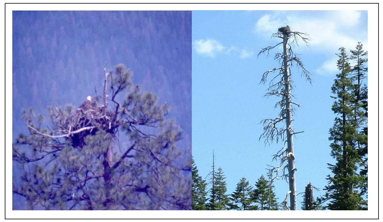
Figure 1. Comparison between typical bald eagle nesting structure located on Lake Britton, Shasta Co. (left) and typical osprey nest located at Bucks Lake, Plumas Co. (right).

Bald eagles nest on a variety of natural structures, including projections or ledges on cliffs, trees protruding from cliffs, in deciduous trees lining river courses, and in a number of conifer species found along or near major water bodies (Call 1978). In areas where osprey ( Pandion haliaetus ) and bald eagles occur sympatrically, certain generalities can be assumed to help distinguish between the two species' nests. Bald eagles typically nest in live trees, some with dead tops, and build a large (~1.8 m/6 ft diameter), generally flat-topped and cone-shaped nest usually below the top with some cover above the nest. Osprey nests are usually more rounded and placed on the tops of dead trees. Osprey commonly use artificial structures (e.g., power poles), and their nests are typically smaller than eagle nests (Call 1978; Figure 1).