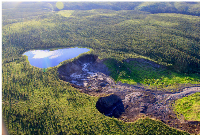
Fig. 1. Abrupt permafrost thaw on the Peel Plateau in Canada. Thawing of ice-rich permafrost can cause abrupt ground collapse, which can further accelerate thaw and amplify permafrost carbon emissions. For scale, the lake length parallel to the headwall of the thaw feature is 150 m.

permafrost and intensifying wildfire regimes present a major challenge to meeting the Paris Agreement’s already difficult goal of holding the global average temperature increase to well below 2 °C above preindustrial levels—and an even bigger challenge to meet the aspirational goal of limiting the temperature increase to 1.5 °C. There is an urgent need for an accelerated scientific effort to more accurately estimate and communicate the likely magnitude of increased carbon dioxide and methane emissions from a warming Arctic to better inform decisions about the “increased ambition” that is needed to keep the global temperature increase well below 2 °C. At present, not even the current scientific understanding of future emissions from a warming Arctic is reflected in most climate policy dialogue and planning. That should be remediated without delay.