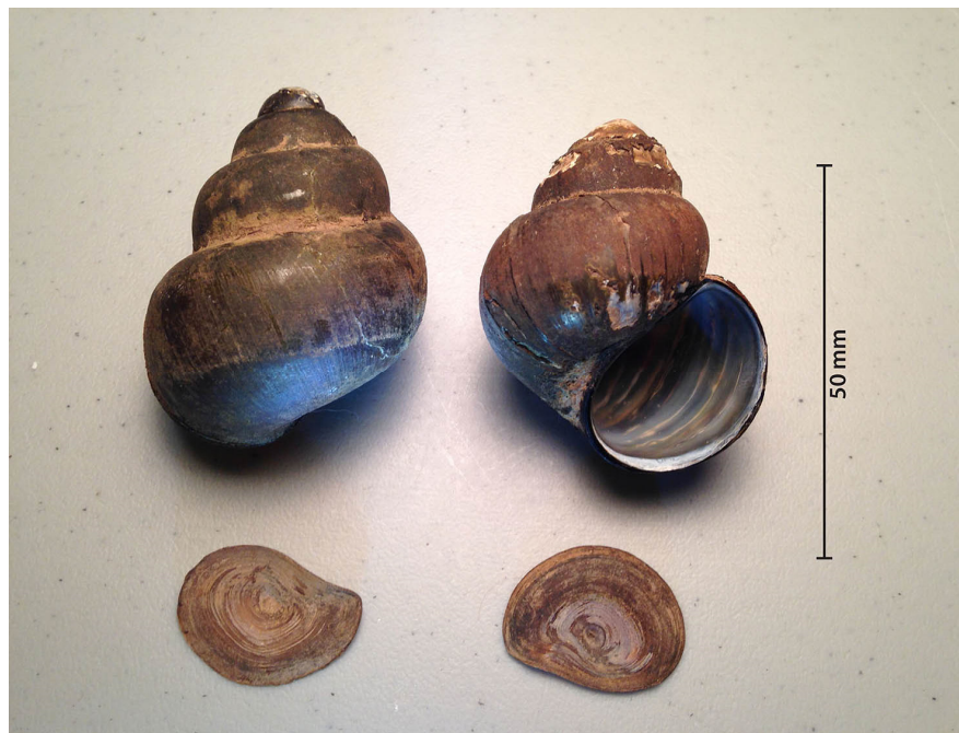
Figure 3. Cipangopaludina chinensis collected live at Sand Point, New Brunswick, 19 August 2014 (NBM 9656).

In locations where C. chinensis is present it may be among the most ubiquitous of invasive aquatic species (Solomon et al. 2010). However, opinion on its ecological impact is divided. Cipangopaludina chinensis has been found to produce no known impacts in the Great Lakes and is considered relatively benign (Kipp et al. 2014). In contrast, C. chinensis may present a threat to native molluscs (Bury et al. 2007) and experimental evidence suggests C. chinensis might reduce native snail populations through competitive exclusion and alter nutrient cycling and algal biomass (Clark 2009; Johnson et al. 2009). However, little field evidence has been found to support impacts on native molluscs. Solomon et al. (2010) and Mackie (2000) likewise considered C. chinensis to have few impacts where introduced. At the low density observed in the Saint John River it is unlikely that C. chinensis will cause significant ecosystem effects. However, the possible introduction of C. chinensis via boat traffic emphasizes the need for better boater education combined with monitoring of the Saint John River system for potentially more troublesome introductions, including the zebra mussel, Dreissena polymorpha . In addition, legislation applicable to the Atlantic region (perhaps modelled on the Ontario Invasive Species Act; in effect 3 November 2016) restricting the import of C. chinensis , popular for water gardens and in the aquarium trade, could help to limit further introductions.