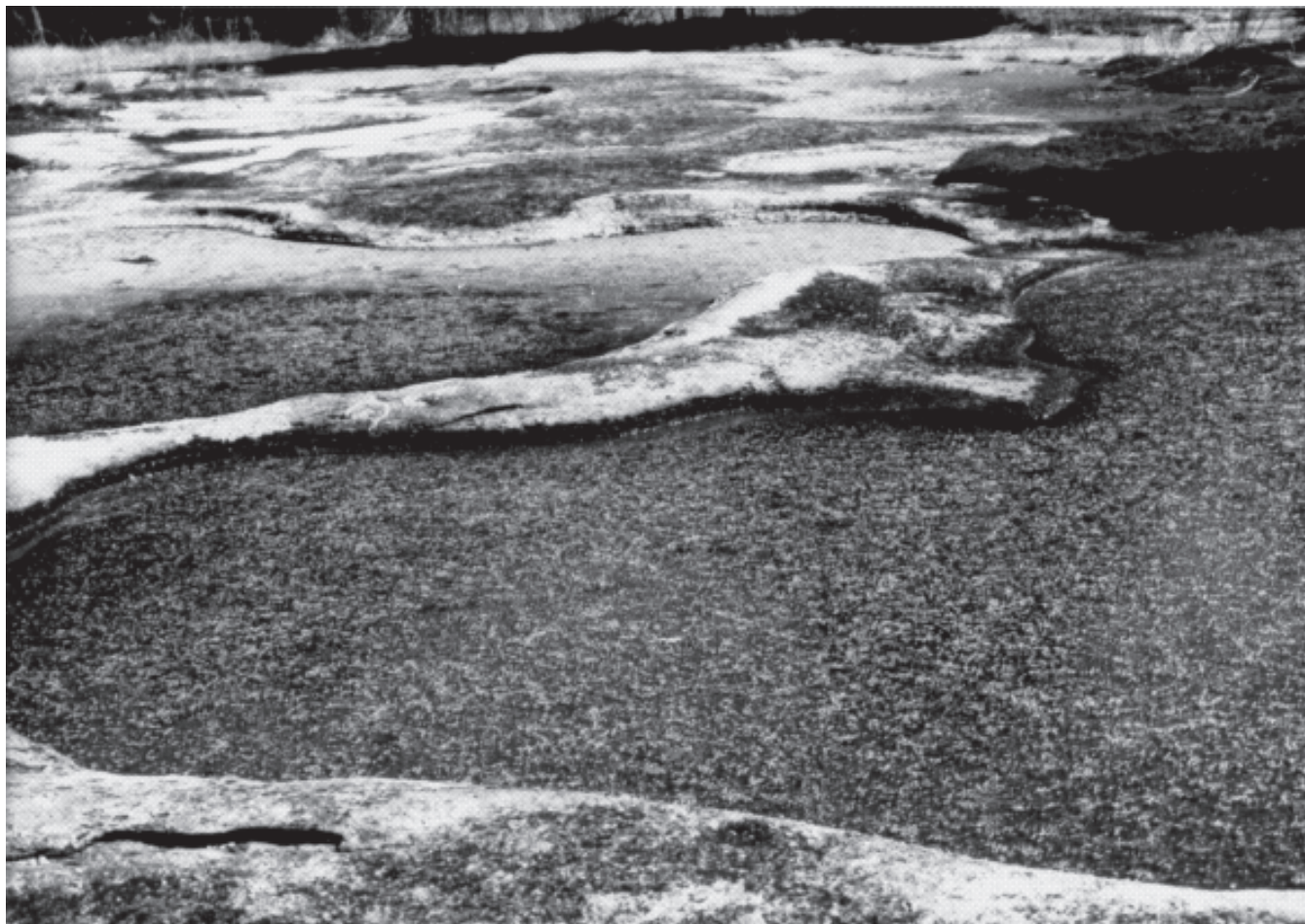
FIGURE 3. Vernal pool dominated by Amphianthus pusillus on Heggies Rock in eastern Georgia, U.S.A., during early spring.

basins. It is for this reason that Amphianthus pusillus , one of the few specialized vernal pool species, is capable of completing its life cycle in as little as three weeks (Hilton and Boyd, 1996). Historical factors could also play a role since, unlike California, this region is not rich in genera of annuals. The granite outcrops themselves, however, seem to have evolved a significantly higher proportion of annuals than is typical for the region (Phillips, 1982). In the literature one can find passing reference to similar rock pools in other parts of the world.