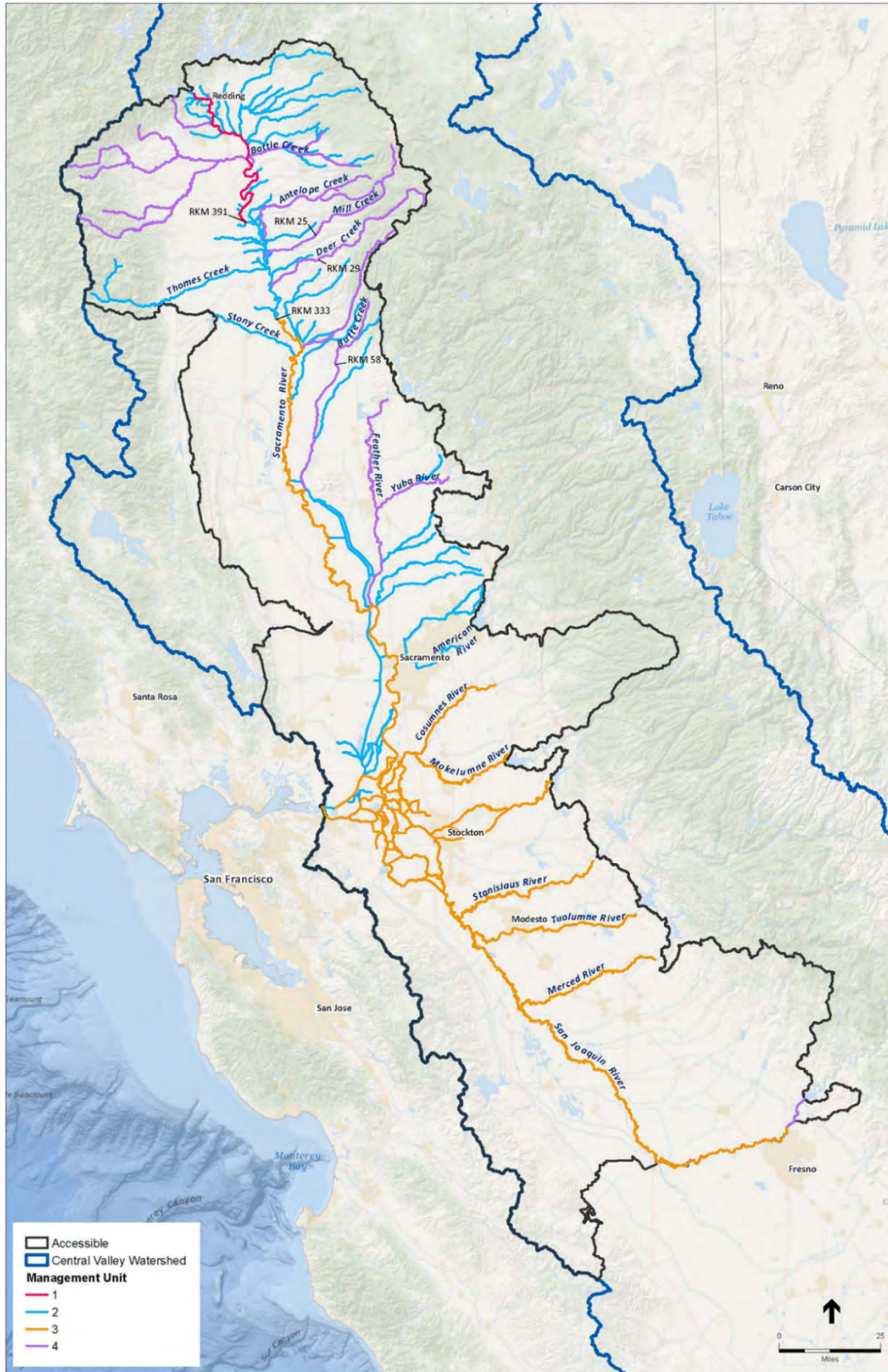
Figure 1-1: Central Valley Management Units (MUs)